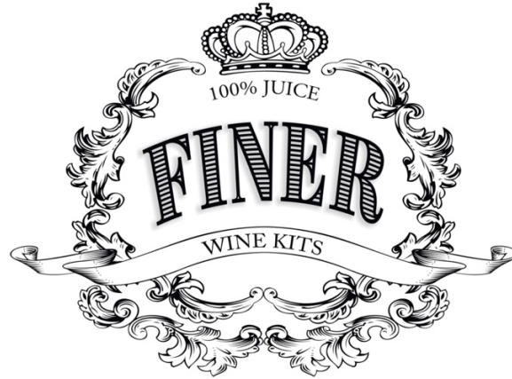
Tavola Whites, Blushes and Rosés Abbreviated Instructions for Advanced Users

Finer Wine Kits delivers a more authentic agricultural product for a better home winemaking experience. We have pioneered the use of refrigeration and cold shipping to retain more of the grape's integrity bringing you, the winemaker, closer to the vineyard.